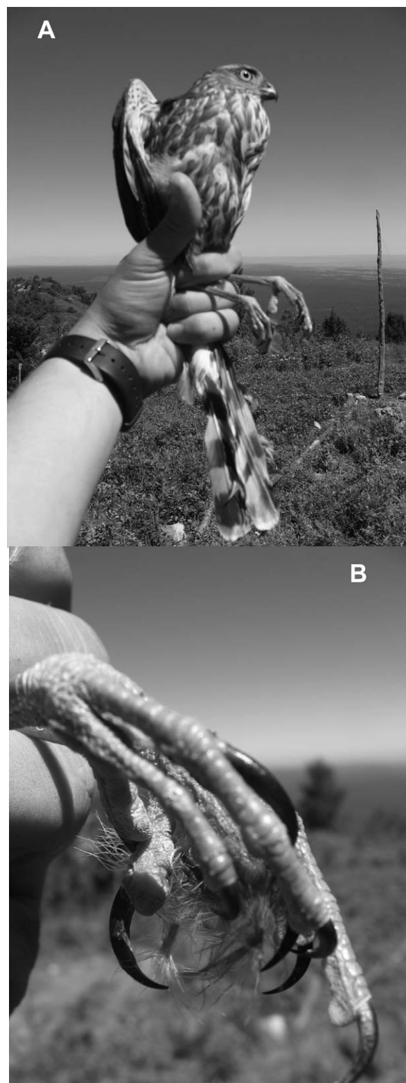
FIGURE 1. (A) A hatch-year Sharp-shinned Hawk captured at Capilla Peak in the Manzano Mountains, New Mexico, with distended crop, indicating recent prey capture and consumption. (B) Close-up of feet of the same bird, showing feathers of prey stuck to toes and talons.

Other researchers sampled potential avian prey in the area at two sites, one near the raptor-banding site at Capilla Peak (DeLong et al. 2005) and the other 35 km north of Capilla Peak in the foothills of the Manzanita Mountains near Coyote Springs. The mist-netting site at Capilla Peak was ~1 km from the primary raptor-banding site along the same ridge complex used by migrating raptors. Migrating raptors frequently passed through the netting area, hunted in the vicinity, and were occasionally captured in the mist nets. The Coyote Springs mist-netting site was in the same mountain range as Capilla Peak, with raptors known to pass through the area before arriving at Capilla Peak. Thus prey sampled